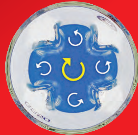
GS vessel principle (viewed from above)

Our GS-glasses are available in chemical- and temperature-resistant borosilicate glass or in stainless steel. Dimensions from a few milliliters to several liters are available, with or without lid, with or without sealed feedthrough.